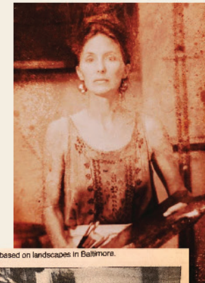
Inner Harbor Triptych, based on landscapes in Baltimore.